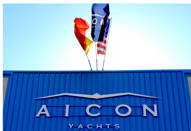
Flags Aicon, USA, Sicily

In Aicon Yachts the United States of America embraces Sicily. A marriage that seems destined to bear important fruits over time. To ask who have already come into contact with the new entrepreneurial reality, experiencing the atmosphere you breathe from the inside.